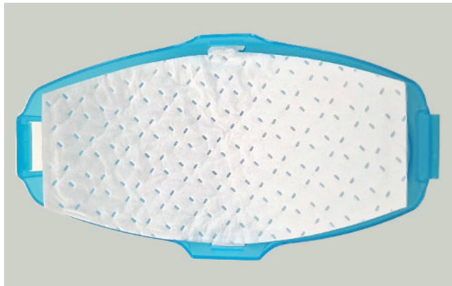
STEP 1. Insert a new filter to the blue outer case.