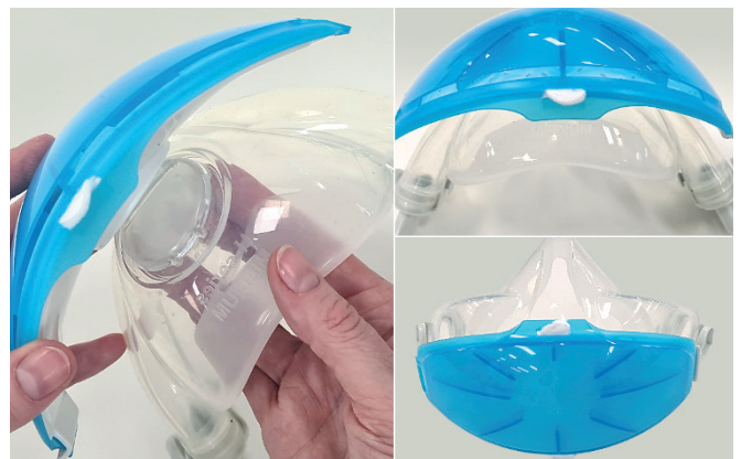
STEP 4. Align the assembled case with filter to the mask exhalation cap so the outer case vents are at the bottom of the mask. Click the case onto the exhalation valve seat. NOTE: The exhalation valve cap can remain in place.