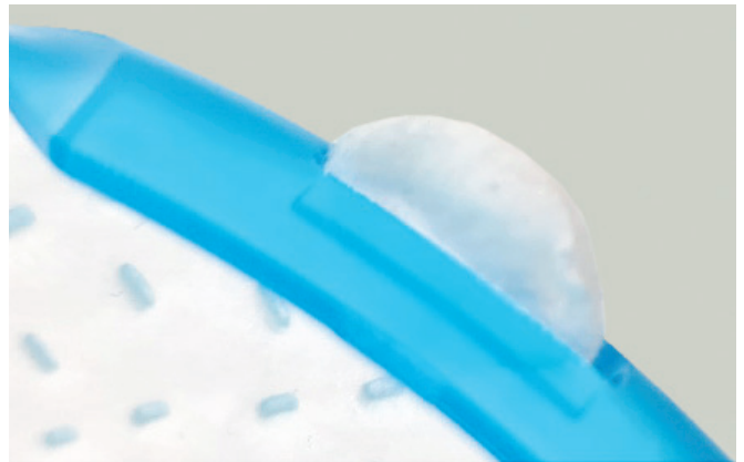
STEP 2. Ensure filter tabs are positioned in the case slots to hold the filter in place.