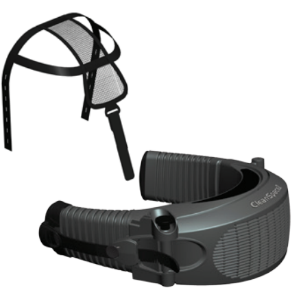
CLEANSPACE2 PAPR PAF-0034 STANDARD USE