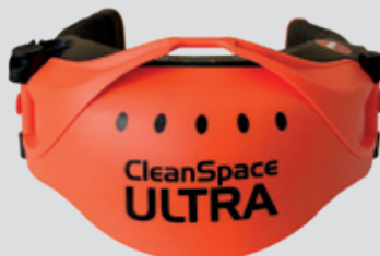
CLEANSPEACE ULTRA PAPR PAF-0070