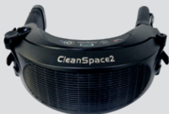
CLEANSPEACE2 PAPR PAF-0034