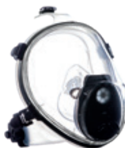
Full Face Mask

CST1034 - Small CST1035 - Medium CST1036 - Large