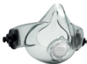
Half Mask (includes head harness)

CST1034 - Small CST1035 - Medium CST1036 - Large