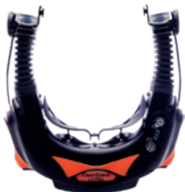
CleanSpace ULTRA CST1011

Power Unit, neck supports, charger & carry bag (excludes mask and filter)